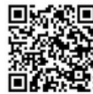
Photo QR Code